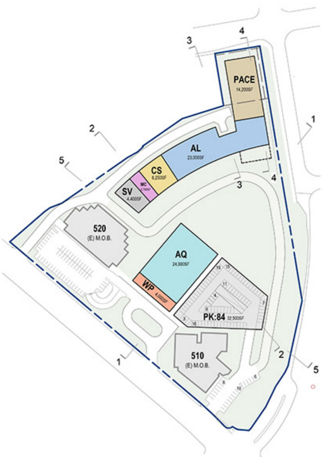
OPTION A-PH2 - 1ST FLOOR PROGRAMMATIC DIAGRAM 1" = 100'-0" 1