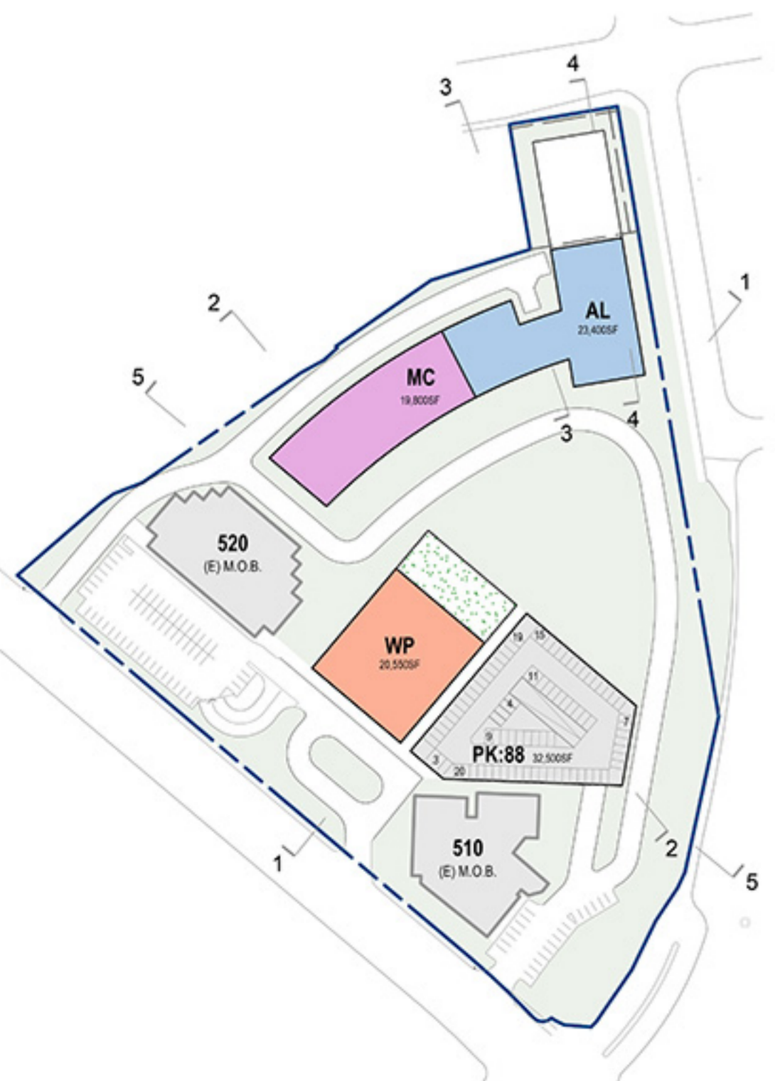
OPTION A-PH2 - 3RD FLOOR PROGRAMMATIC DIAGRAM 1" = 100'-0" 3