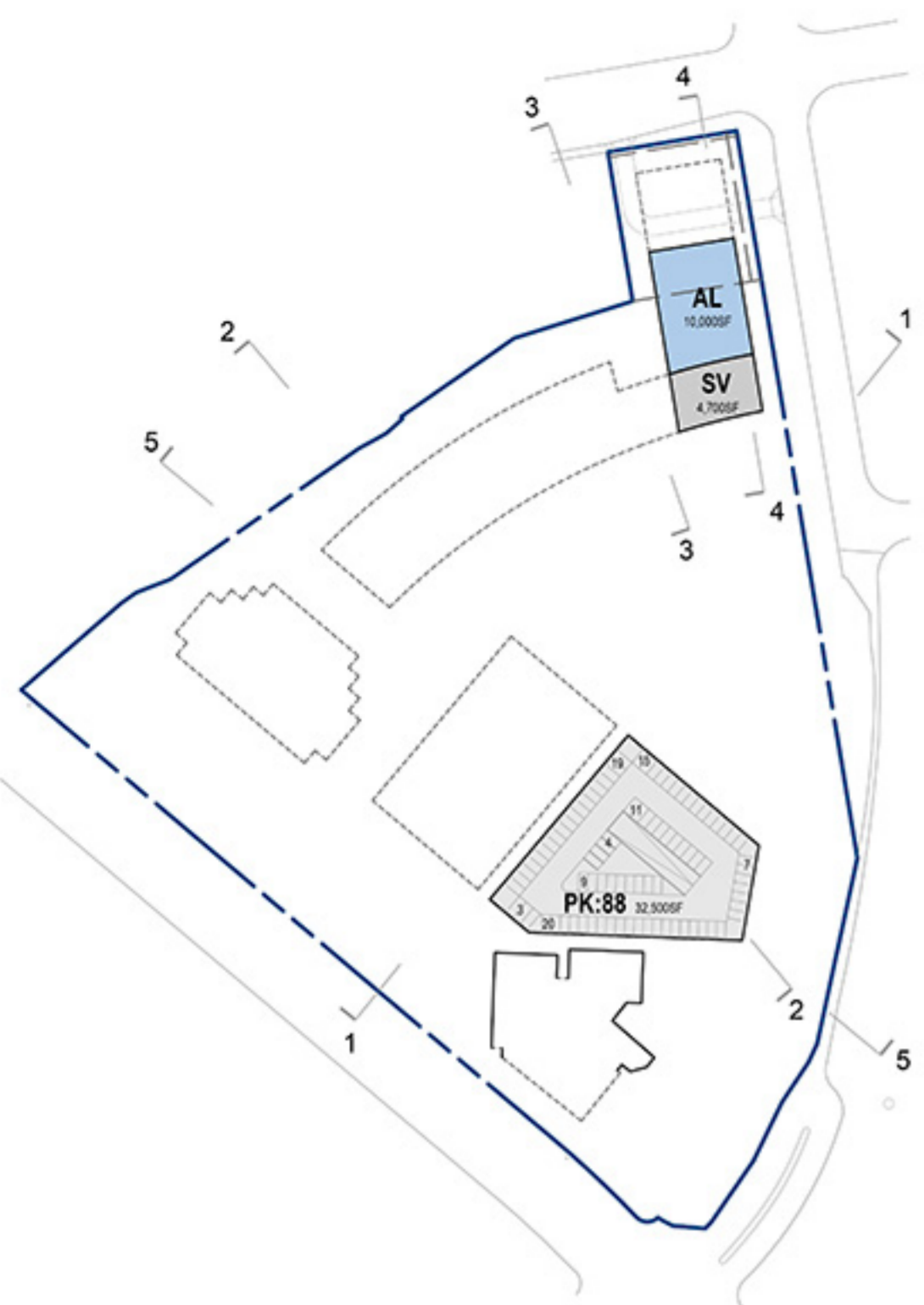
OPTION A-PH2 - B1 FLOOR PROGRAMMATIC DIAGRAM 1" = 100'-0" 0