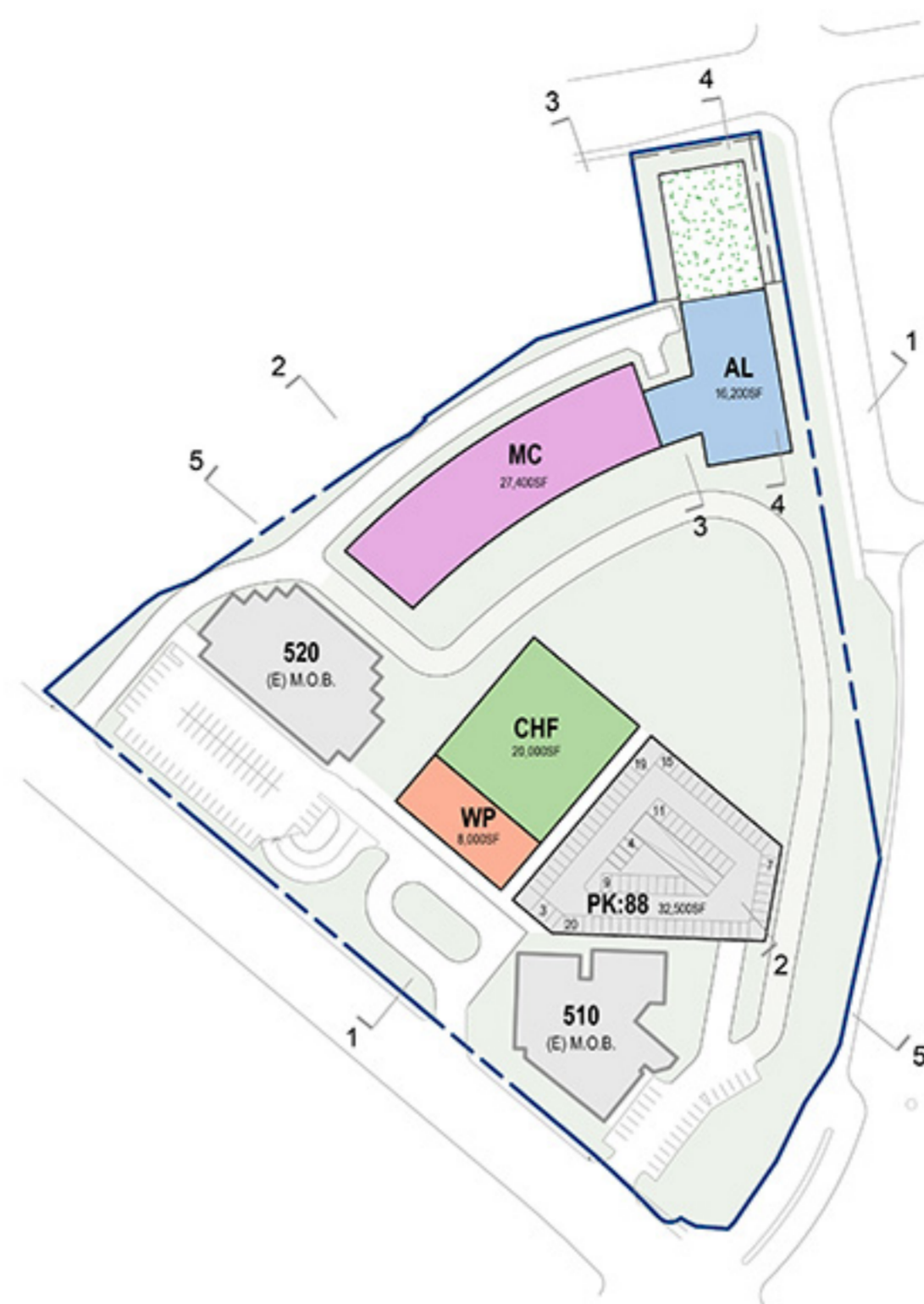
OPTION A-PH2 - 2ND FLOOR PROGRAMMATIC DIAGRAM 1" = 100'-0" 2