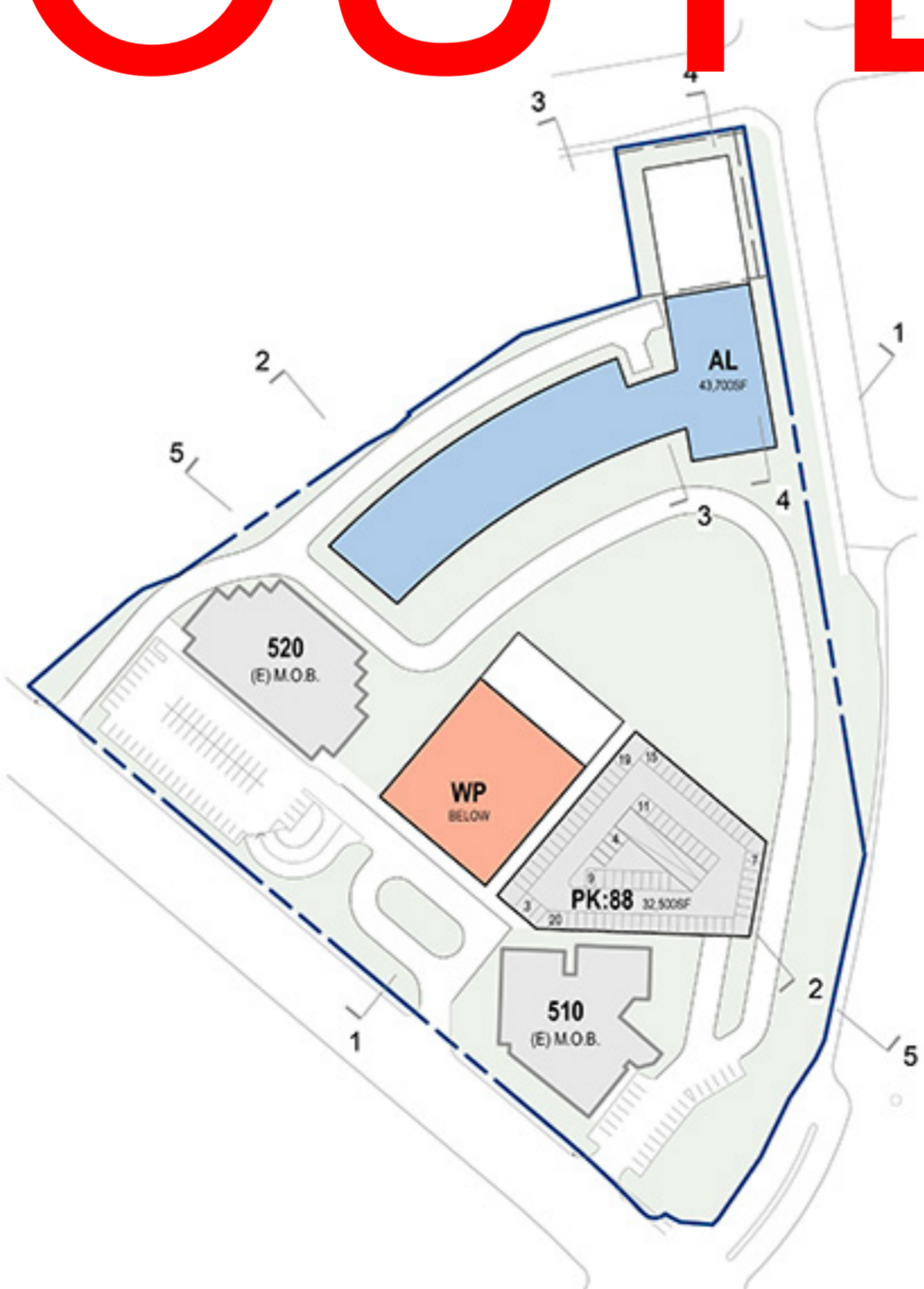
OPTION A-PH2 - 4TH FLOOR PROGRAMMATIC DIAGRAM 1" = 100'-0" 4