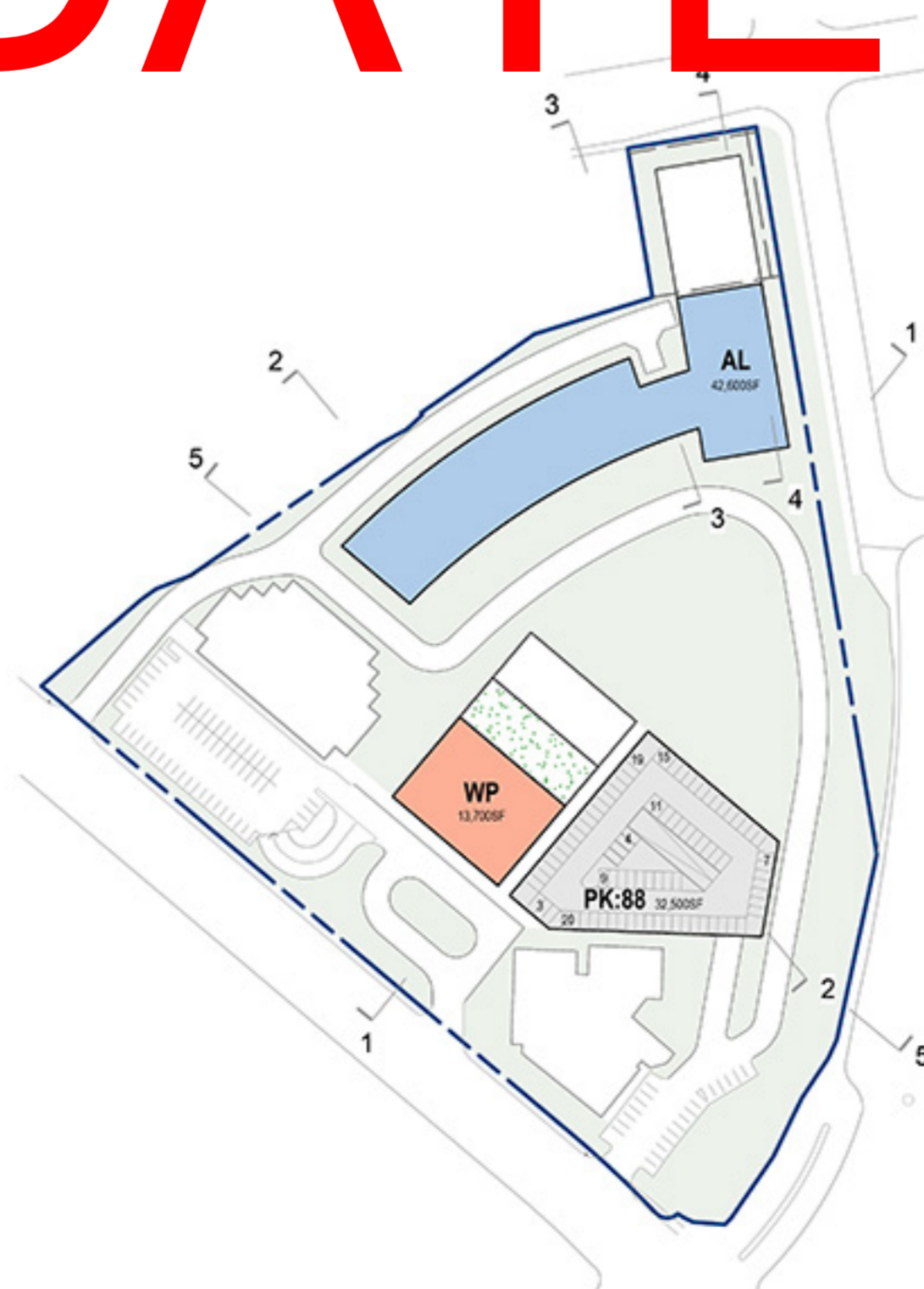
OPTION A-PH2 - 5TH FLOOR PROGRAMMATIC DIAGRAM 1" = 100'-0" 5