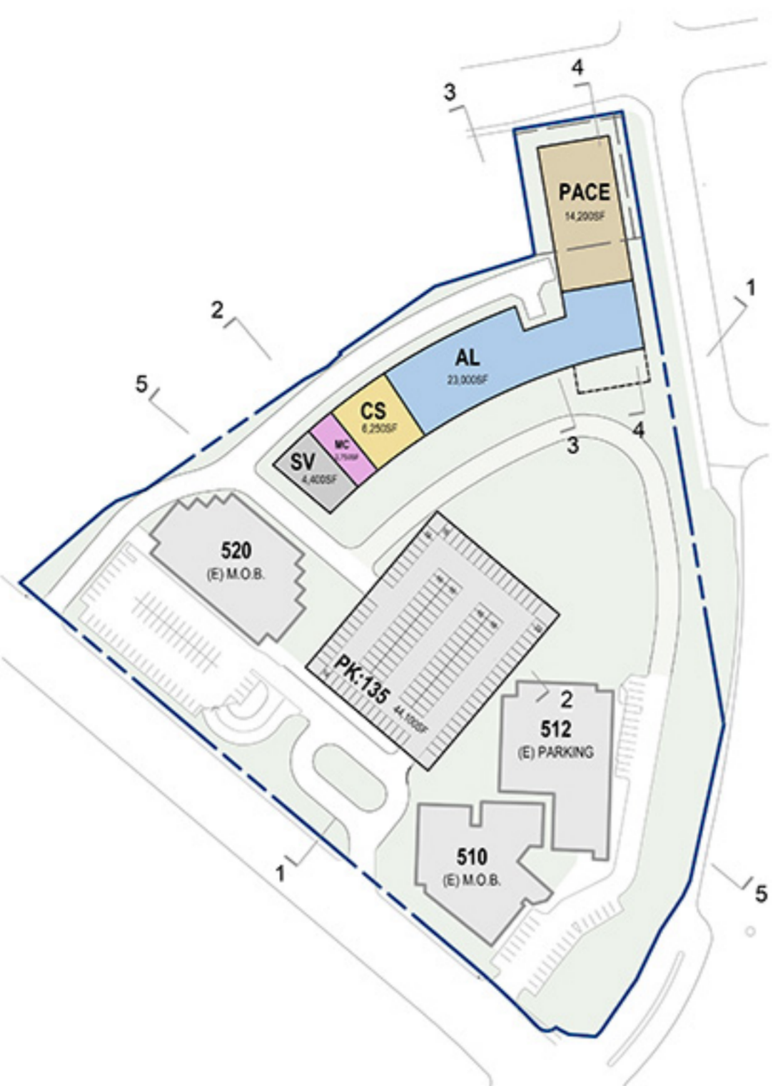
OPTION A-PH1 - 1ST FLOOR PROGRAMMATIC DIAGRAM 1" = 100'-0" 1