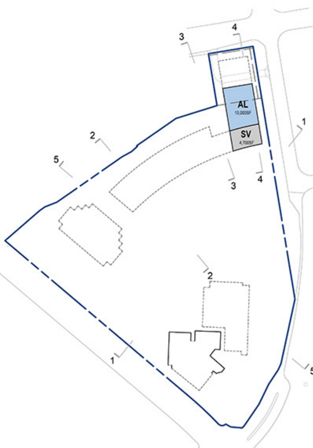
OPTION A-PH1 - B1 FLOOR PROGRAMMATIC DIAGRAM 1" = 100'-0" 0