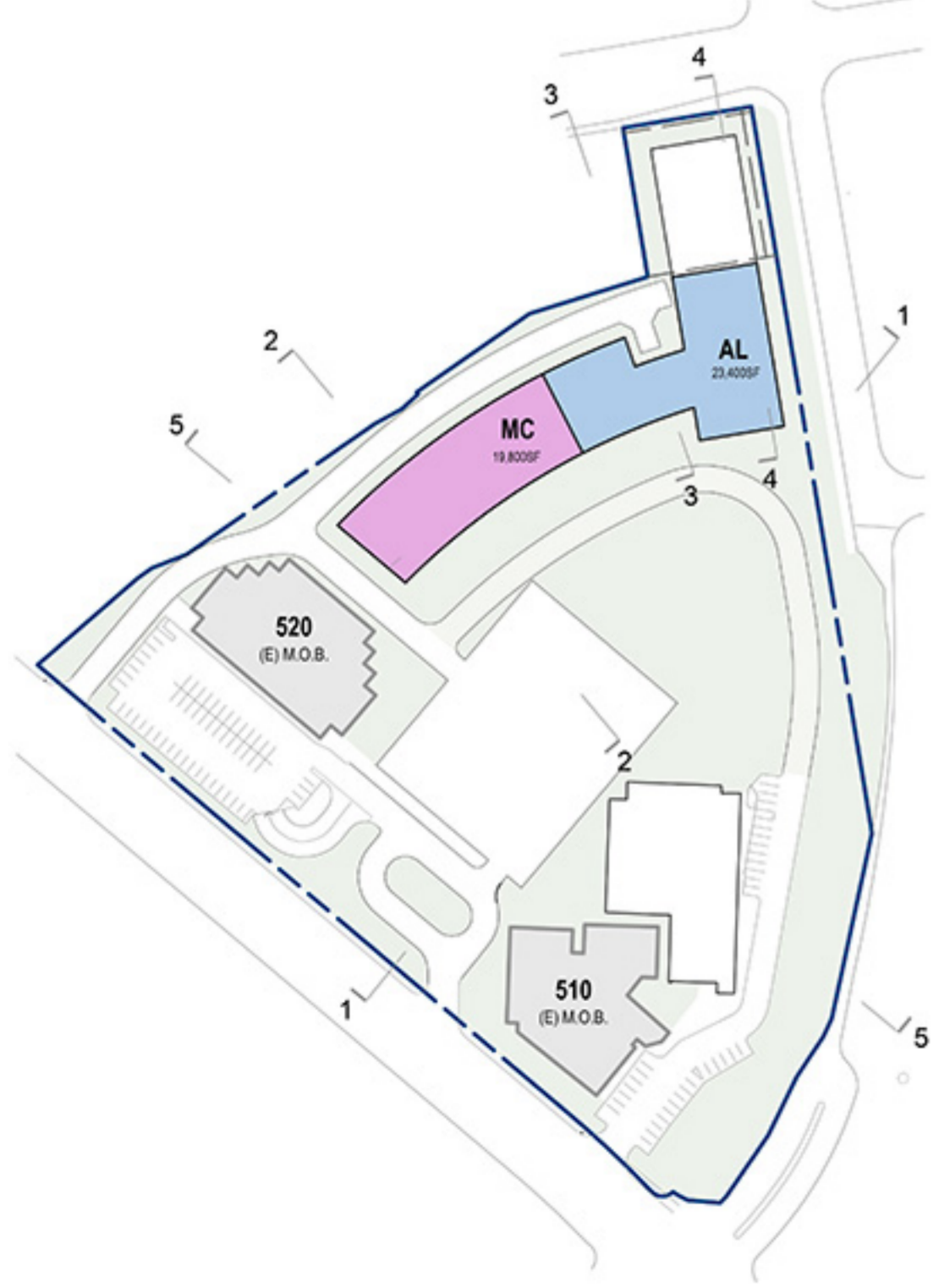
OPTION A-PH1 - 3RD FLOOR PROGRAMMATIC DIAGRAM 1" = 100'-0" 3