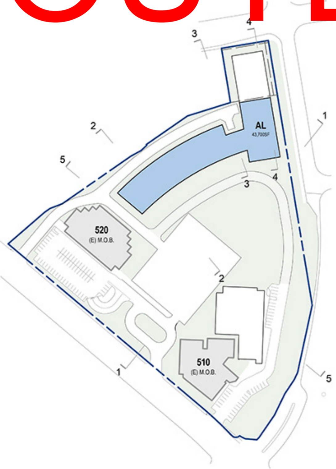
OPTION A-PH1 - 4TH FLOOR PROGRAMMATIC DIAGRAM 1" = 100'-0" 4