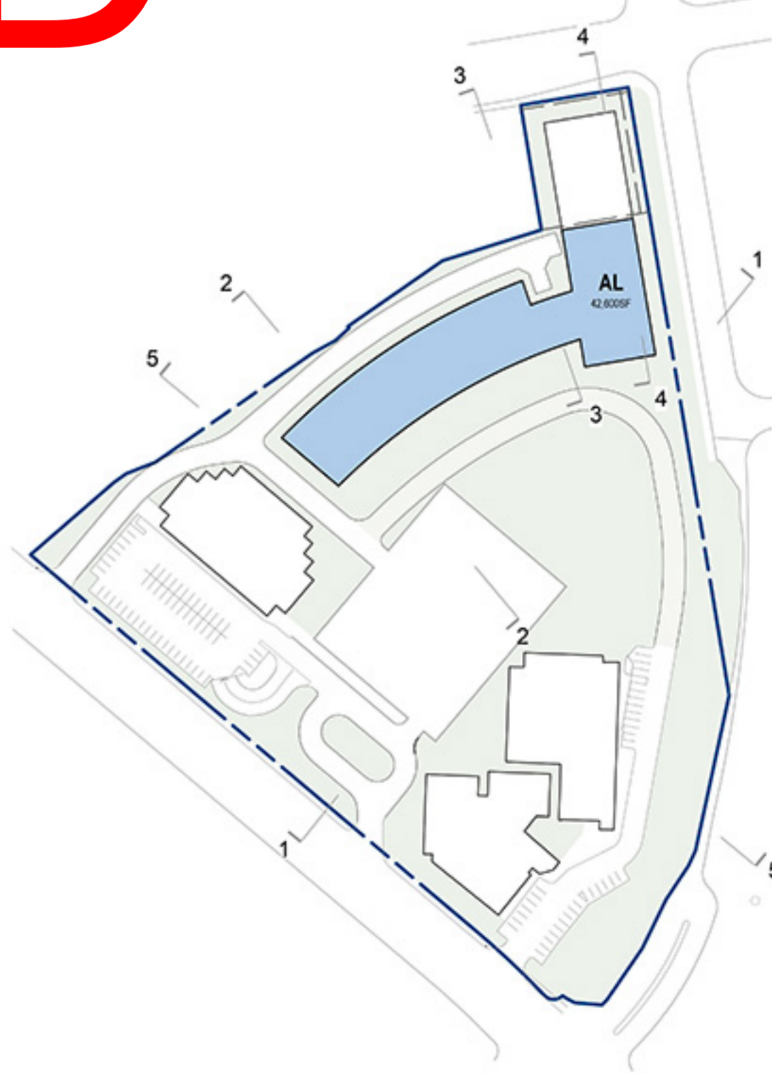
OPTION A-PH1 - 6TH FLOOR PROGRAMMATIC DIAGRAM 1" = 100'-0" 6