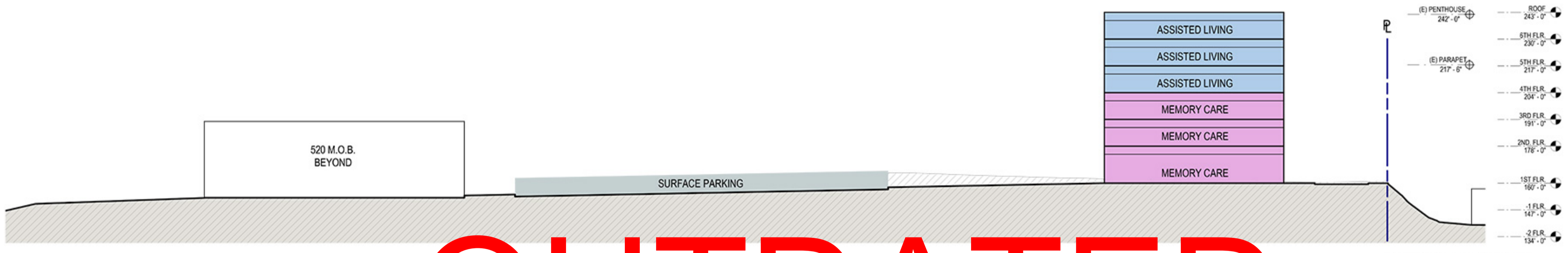
OPTION A-PH1 - SITE SECTION -02 2 1" = 20'-0"