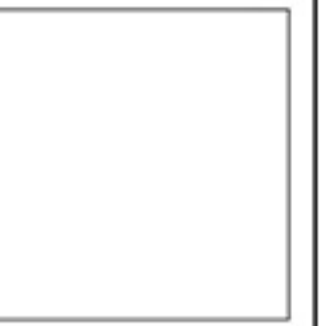
OPTION A-PH1 - 3D-03 3